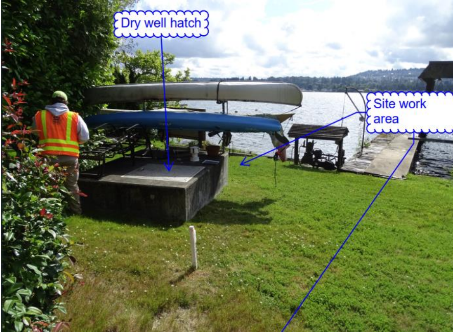
FS 12 – Flush Station